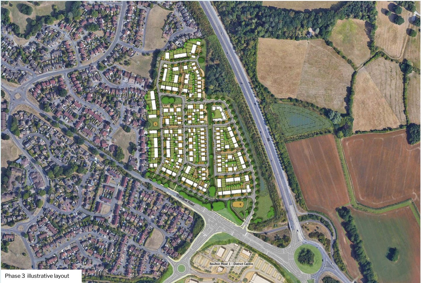
Phase 3 illustrative layout